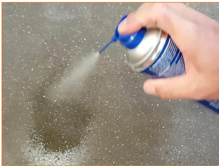
Degrease the surface